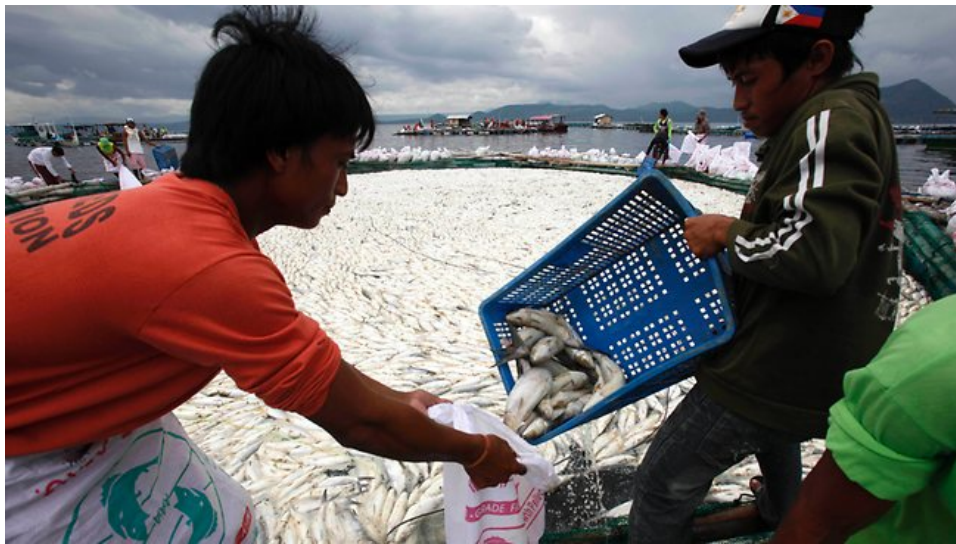
Exhibit 3 Massive fish kills in fish cages