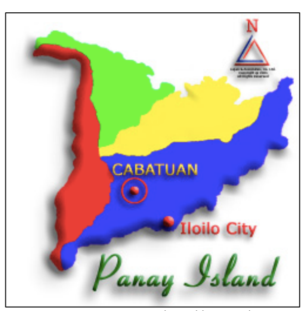
Figure 1 Map of the municipality of Cabatuan, Iloilo, Philippines

Cabatuan is a first class municipality in the Province of Iloilo in the Philippines with 55 thousand residents (Figure 1). The town consists of 68 barangays<sup>i</sup> in 11,290 hectares of land area. It is home to the Iloilo International Airport and is 24 kilometers from Iloilo City, the capital of Western Visayas Region. Major industries include agricultural (common produced are corn and rice) and commercial (commercial livestock).