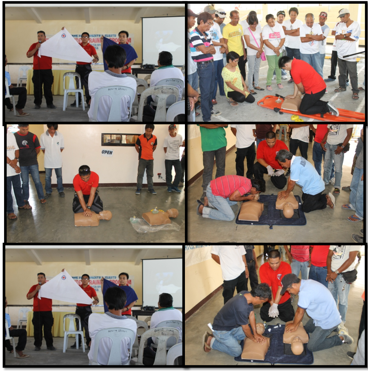
Exhibit B First responders training program in Cabatuan